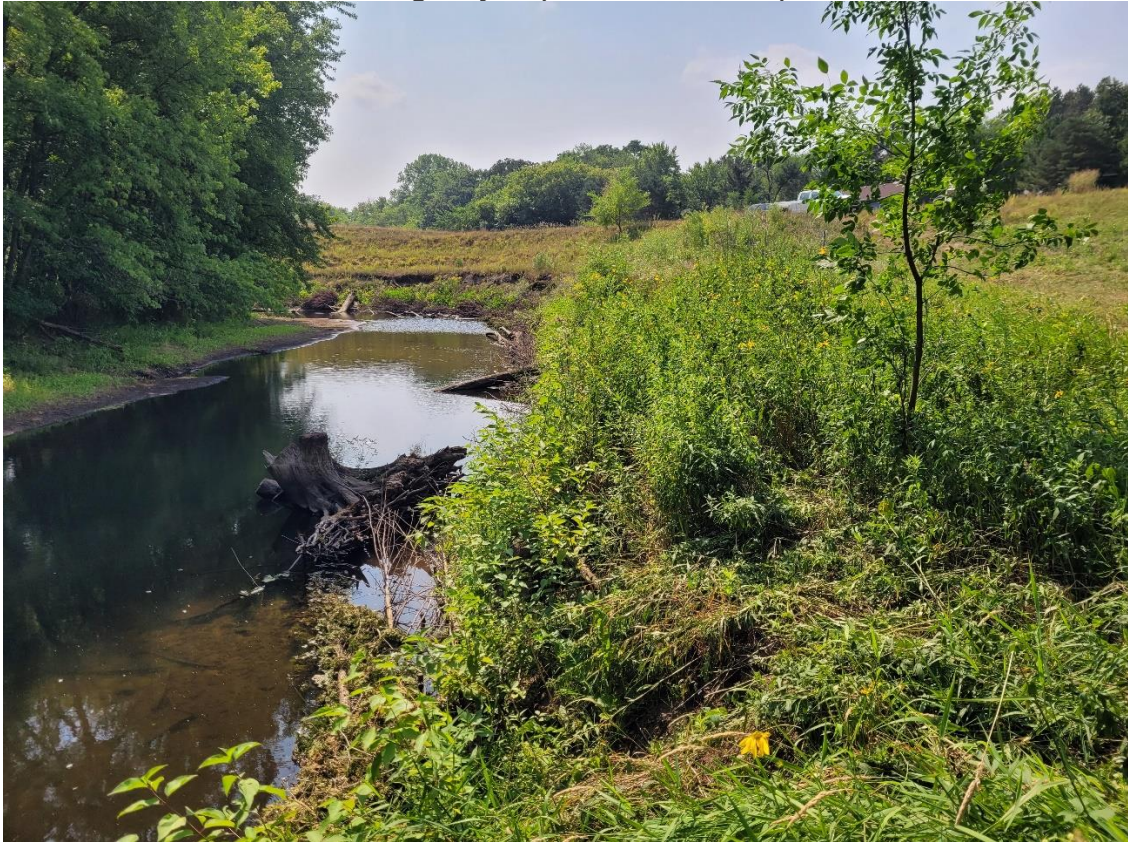
Site 1 – Highway 95 (2012 Construction)